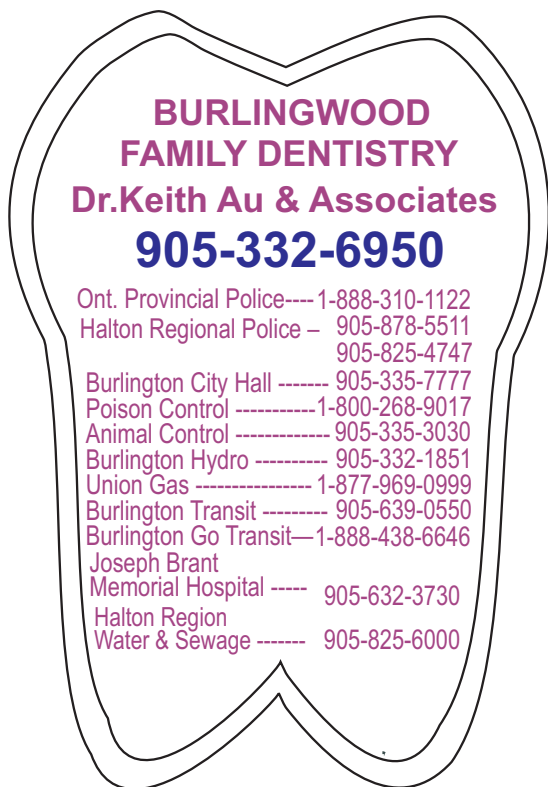
# 84 2 5/8" X 3 3/4"