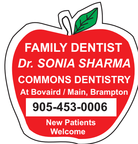
# 8 APPLE 2 1/4" X 2 1/4"