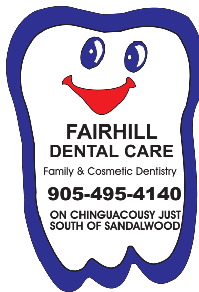
# 106 2" X 3"